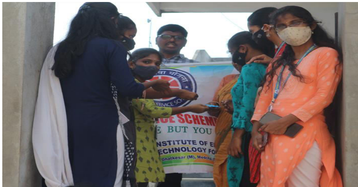
Helping the Villagers with distribution of medicines for the well being during pandemic.

members of this organization. Implementing the purpose of the organization, amount collected was donated to a four-year-old cancer kid who was undergoing treatment at the local cancer hospital. Moreover, many students and staff were benefited with such noble causes. Our staff was very generous in coming forward to help the fellow colleagues at times of distress or ill health.