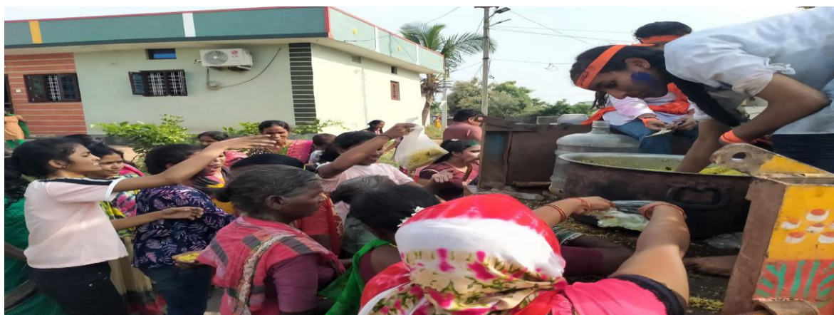
Distribution of Food to the old people at nearby village.

the responsibility of reaching out to the people and bringing the grievances to the appropriate authorities appointed for this aspect.