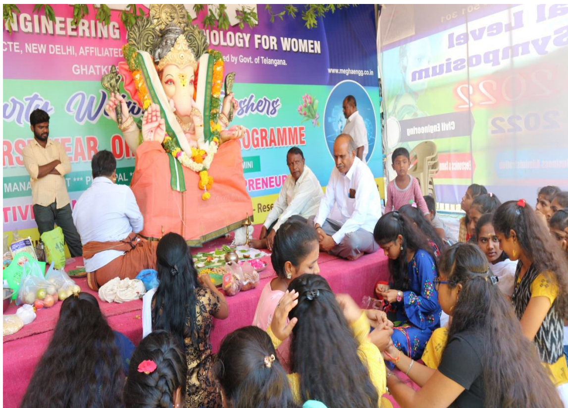
Ganesh Chaturthi Celebration in the campus.

CULTURAL HARMONY: MIETW promotes peace and understanding among students – the only way to live in a unified way in spite of being different. Globalization and cultural harmony have opened new dimensions for democracy. The exchange of ideas and forms of art enriches people individually as well as a nation and even internationally. It helps dispel negative stereotypes and personal biases about different groups. In addition, cultural diversity helps us recognize and respect “ways of being” that are not necessarily our own, so that as we interact with others we can build bridges to trust, respect, and understanding across cultures. MIETW has been a station for such cultural harmony and integrity by celebrating every festival with gaiety.