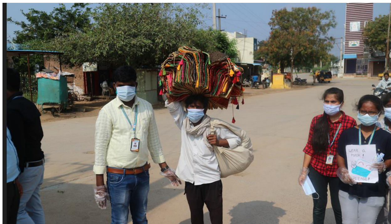
Distribution of Face Masks for the local commuters at the Marripalligudem village