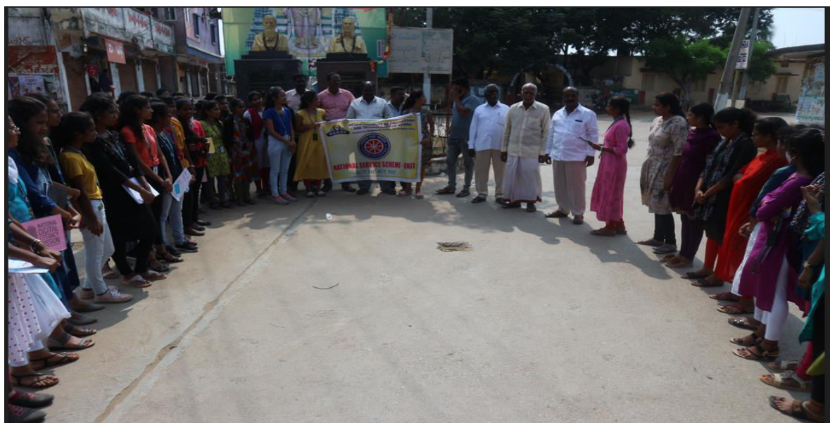
Students interacting with the villagers and knowing about living conditions